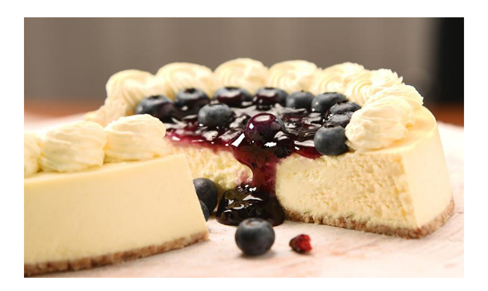
Elegant Blueberry Yogurt's ideal match —